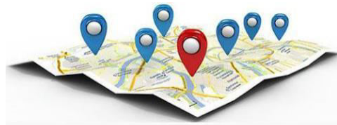
Figure 4.1: Geo-tagging

Successive compare and contrast studies of the success rate in the implementation of the above Conversion Action Plan (CAP) will be taken up in the technology interface of data science. The results so collated would be put up to the environmental wing of Legal Cell, Government of India to propose and draft environmental protection laws – Penal Codes to be executed in the country after dew approval from concerned authorities.