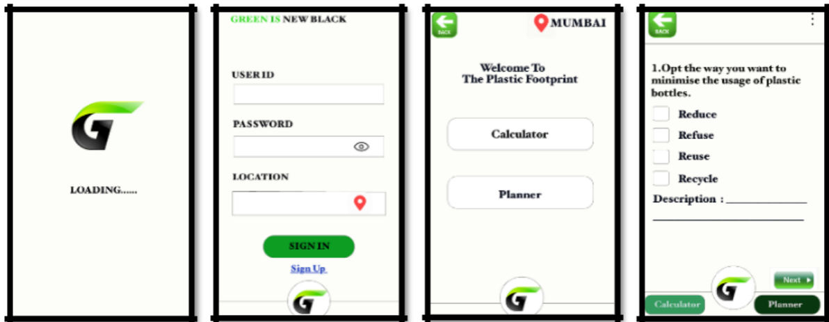
Figure 4.2: User Interface of the Mobile Application

The user interface created using Adobe XD is simple, attractive and easy to navigate.